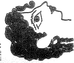
Japheth — (Cretan wall painting of C. 1600 B.C.)