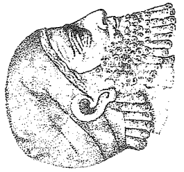
Shem — Assyrian (Relief from palace of Sargon at Khorsabad)