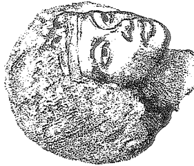
Ham — Ti, Queen of Egypt (Beginning of fourteenth century B.C.)